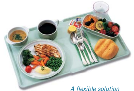
A flexible solution for every requirement

The Burlodge home style flat tray can be personalised to your needs (a large tray or a small tray). Furthermore, the surface area of the tray and the methods of heating and cooling provide each food service expert an opportunity to create a complete meal that is pleasing to see, easy to enjoy, and tempting to each individual and their specific need.